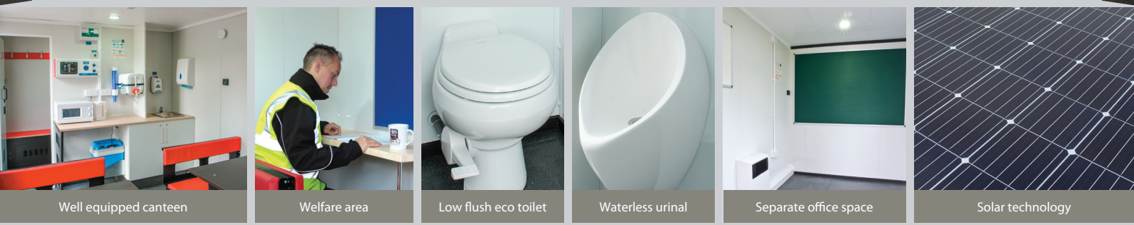
Well equipped canteen